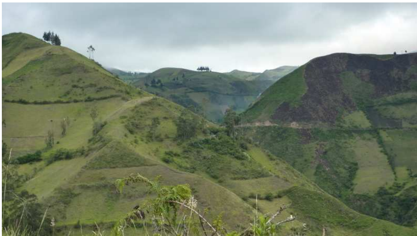
Anhang 5: cotopaxi.jpg (269KB) 0-5 a