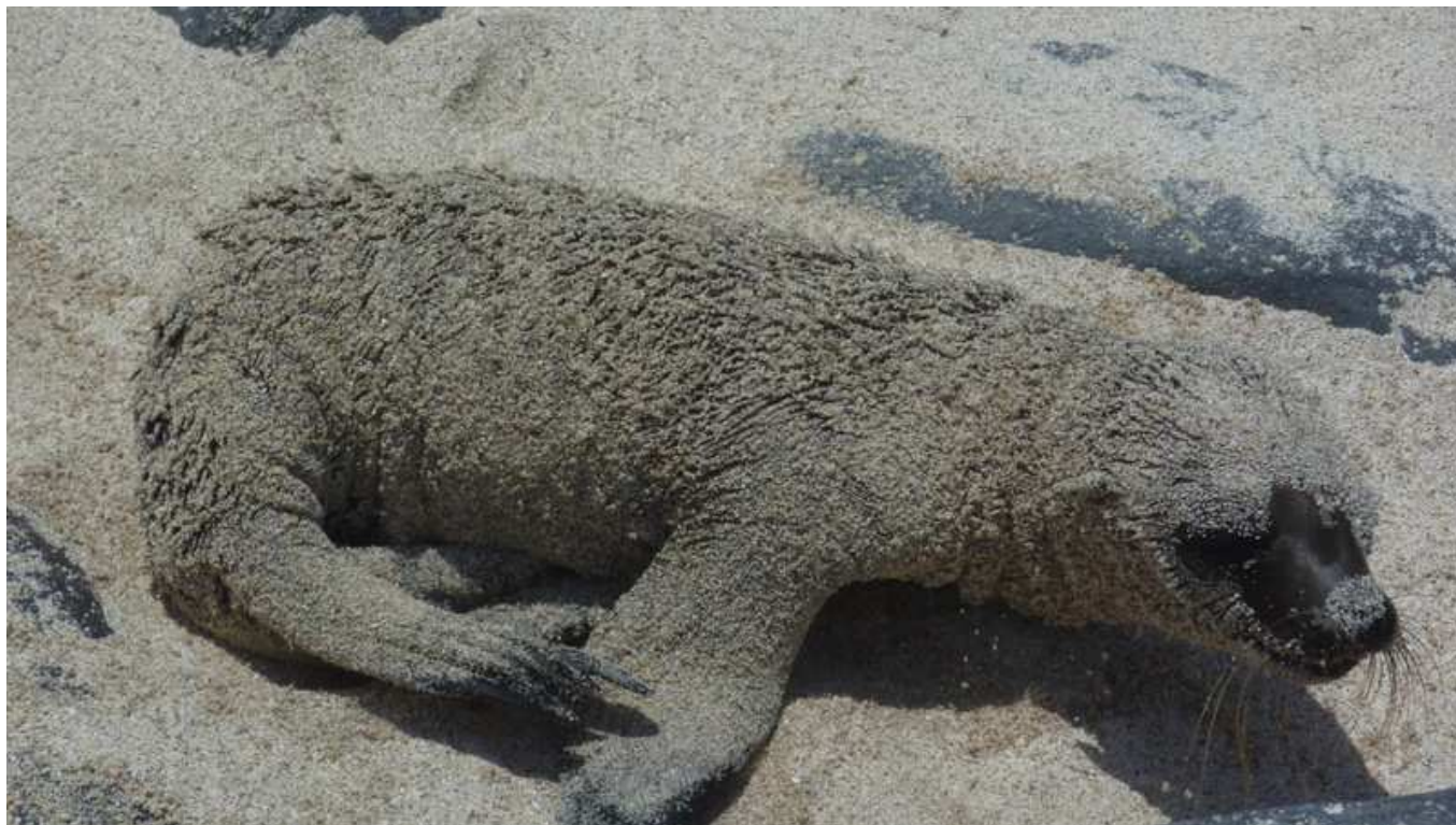
Anhang 9: stop.jpg (258KB) 0-9 a