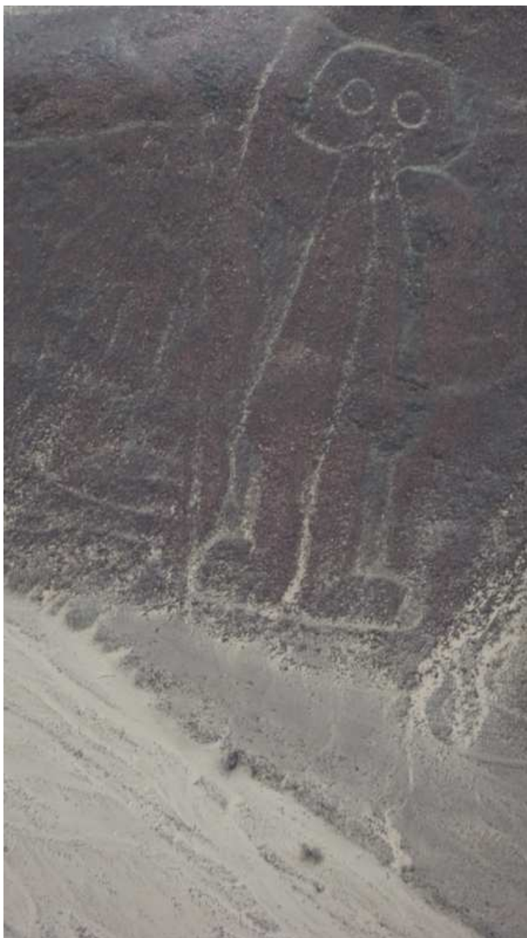
Anhang 4: quilotoa.jpg (280KB) 0-4 a