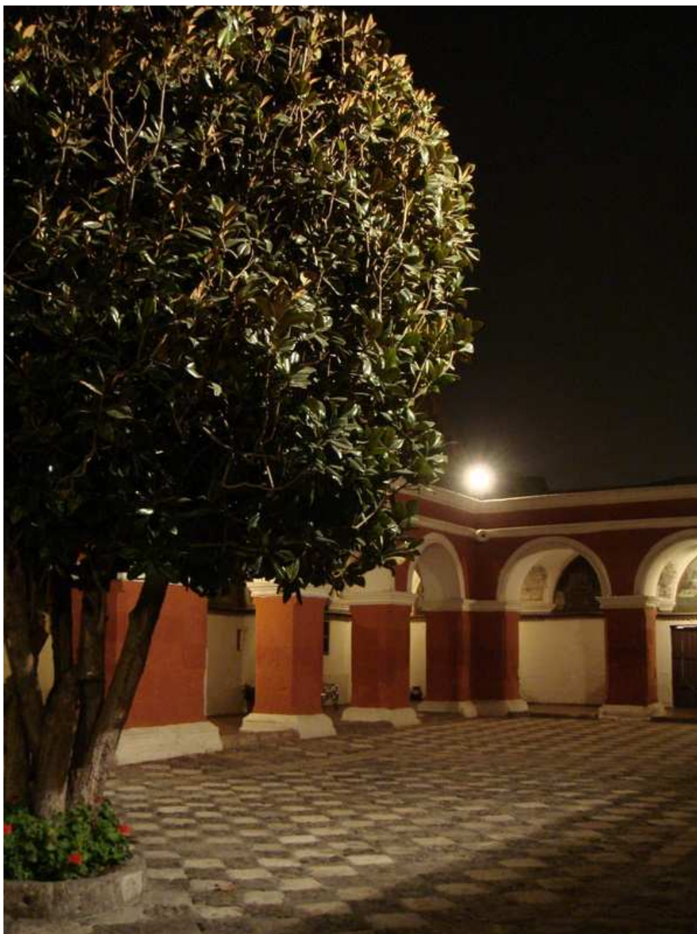
Anhang 3: nasca.jpg (292KB) 0-3 a