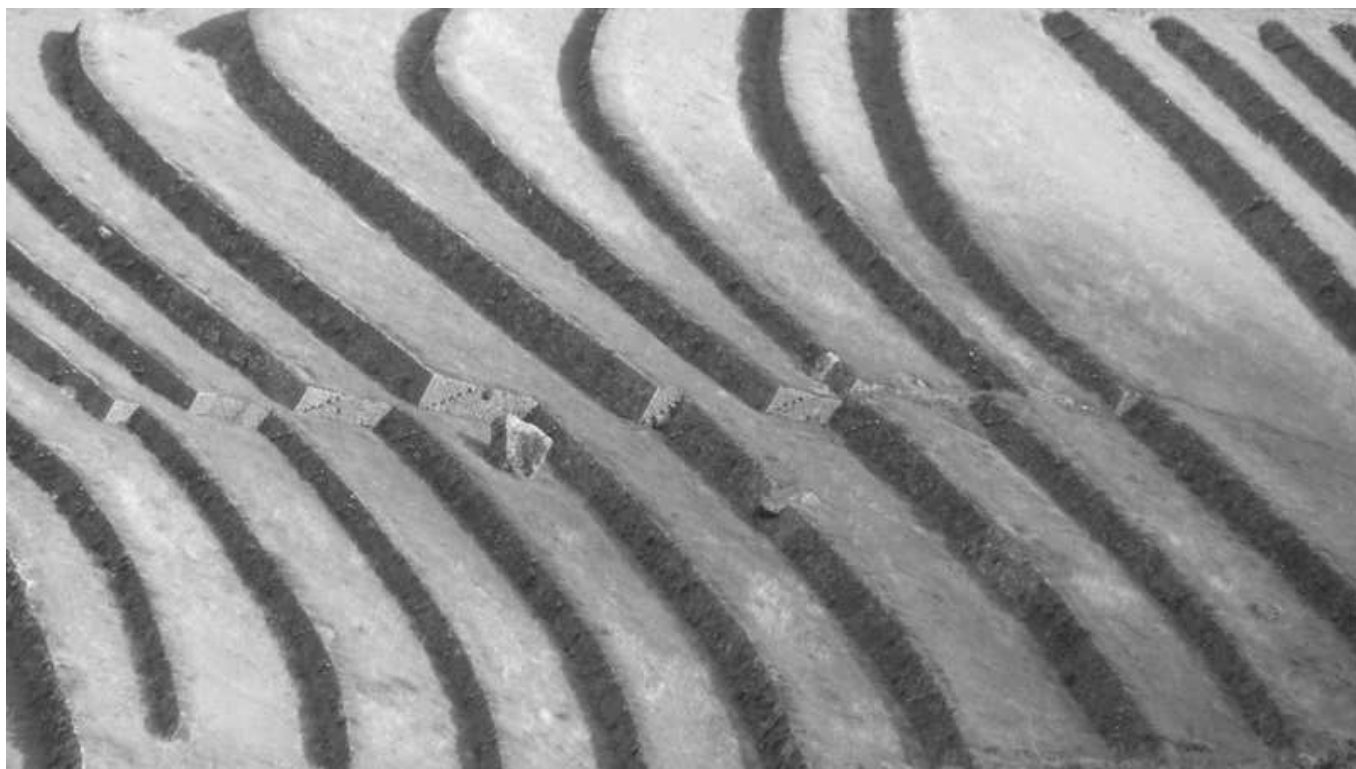
Anhang 7: frog.jpg (141KB) 0-7 a