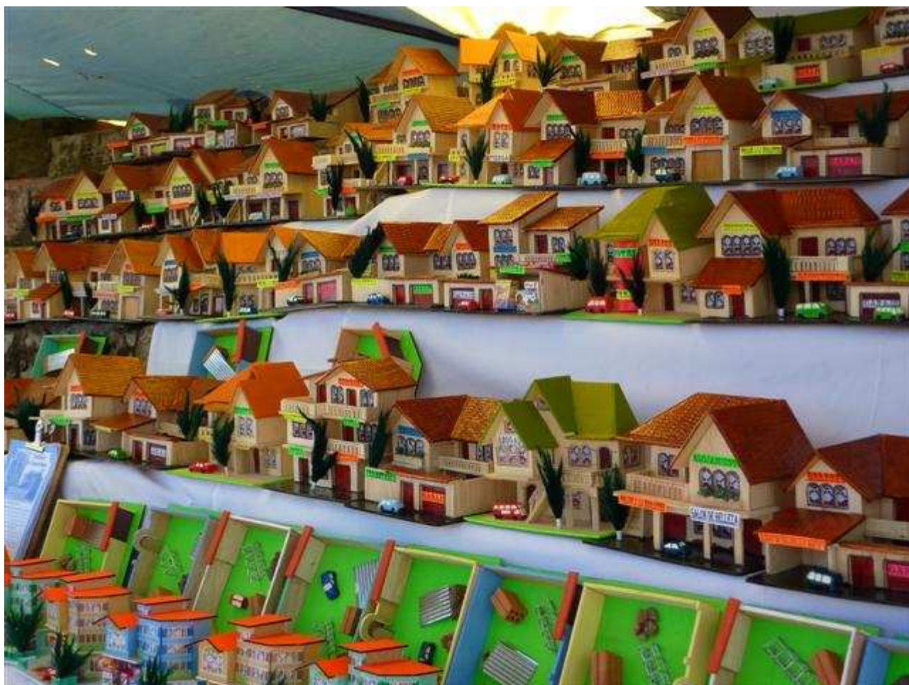
Anhang 10: ferry.jpg (68KB) 0-10 a