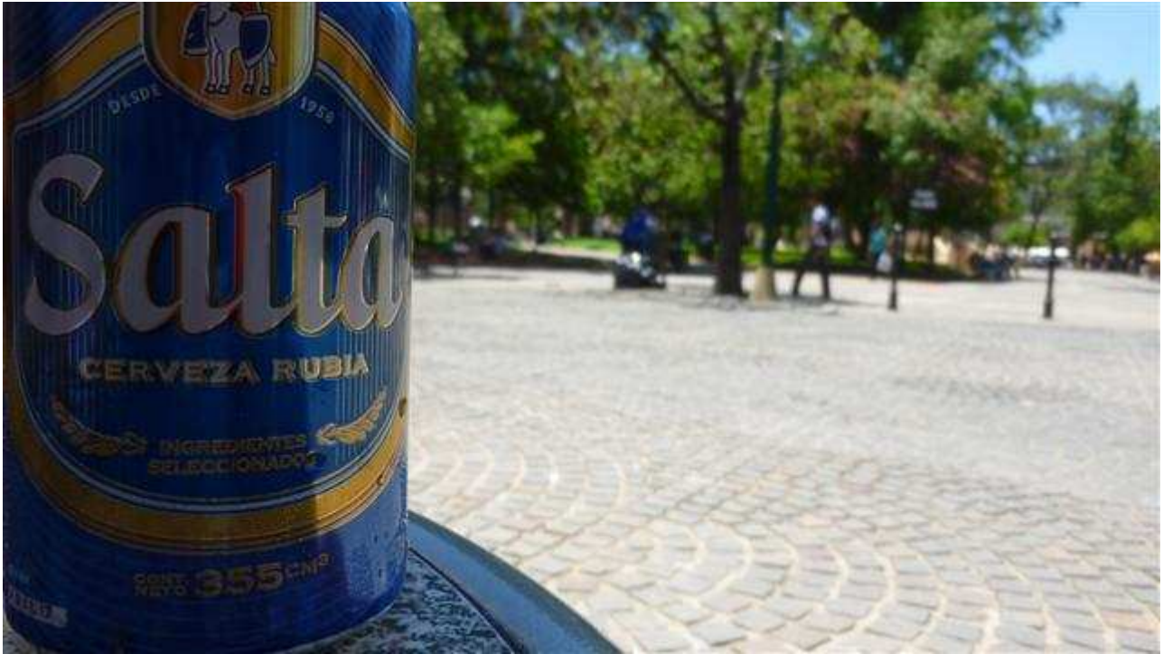
Anhang 6: bike.jpg (64KB) 0-6 a