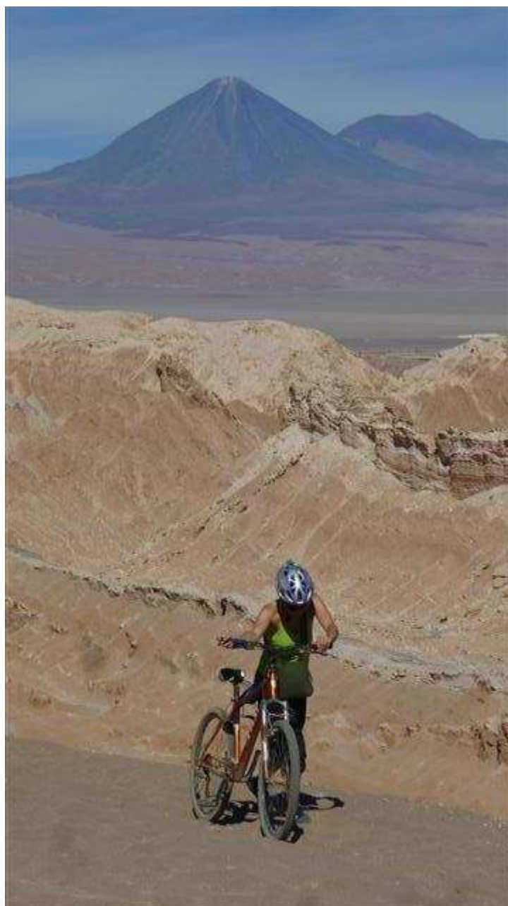
Anhang 5: salta.jpg (55KB) 0-5 a