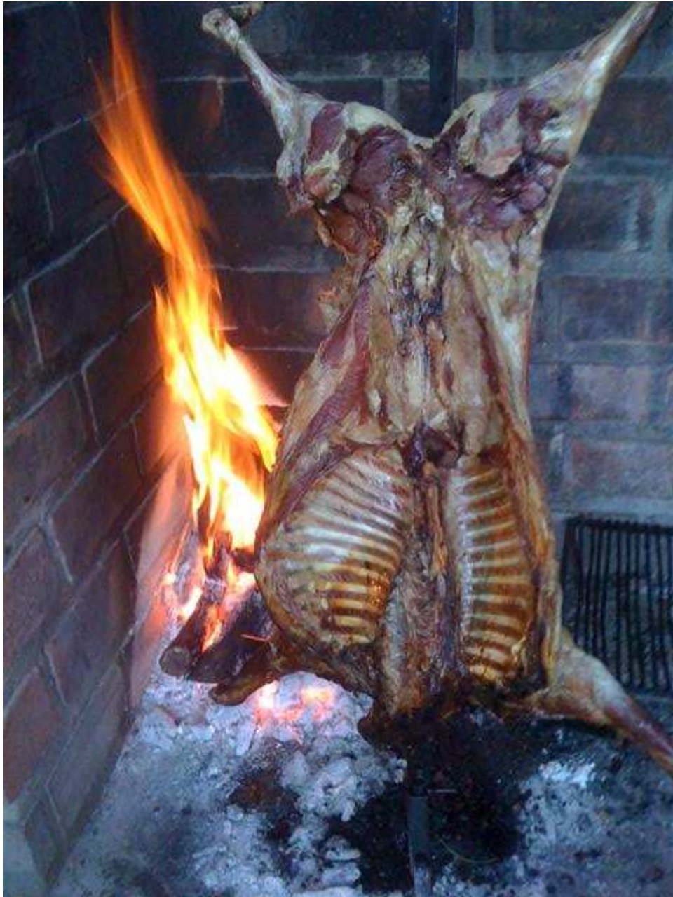
Anhang 2: zopf.jpg (40KB) 0-2 a