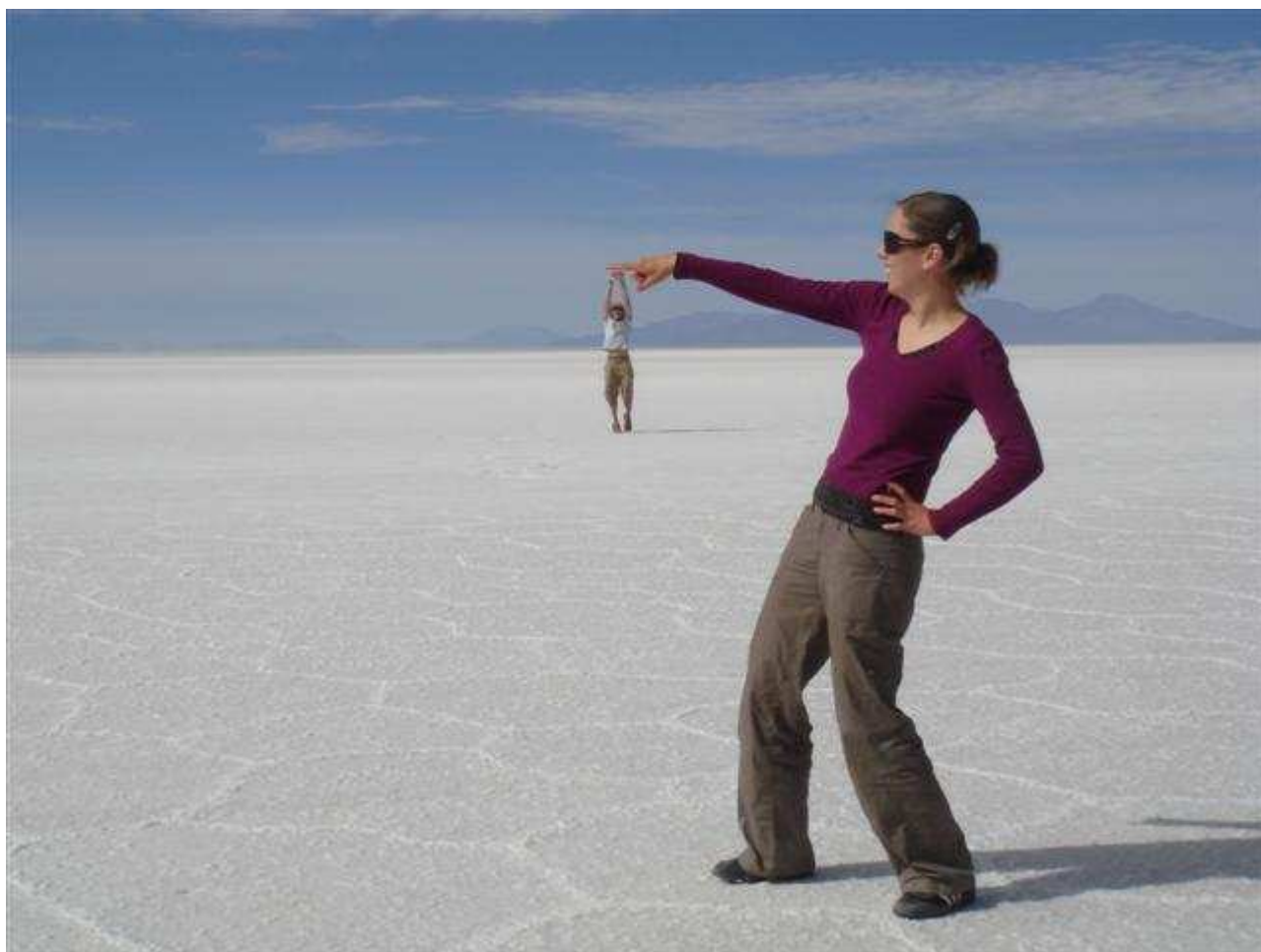
Anhang 8: parinacota.jpg (50KB) 0-8 a