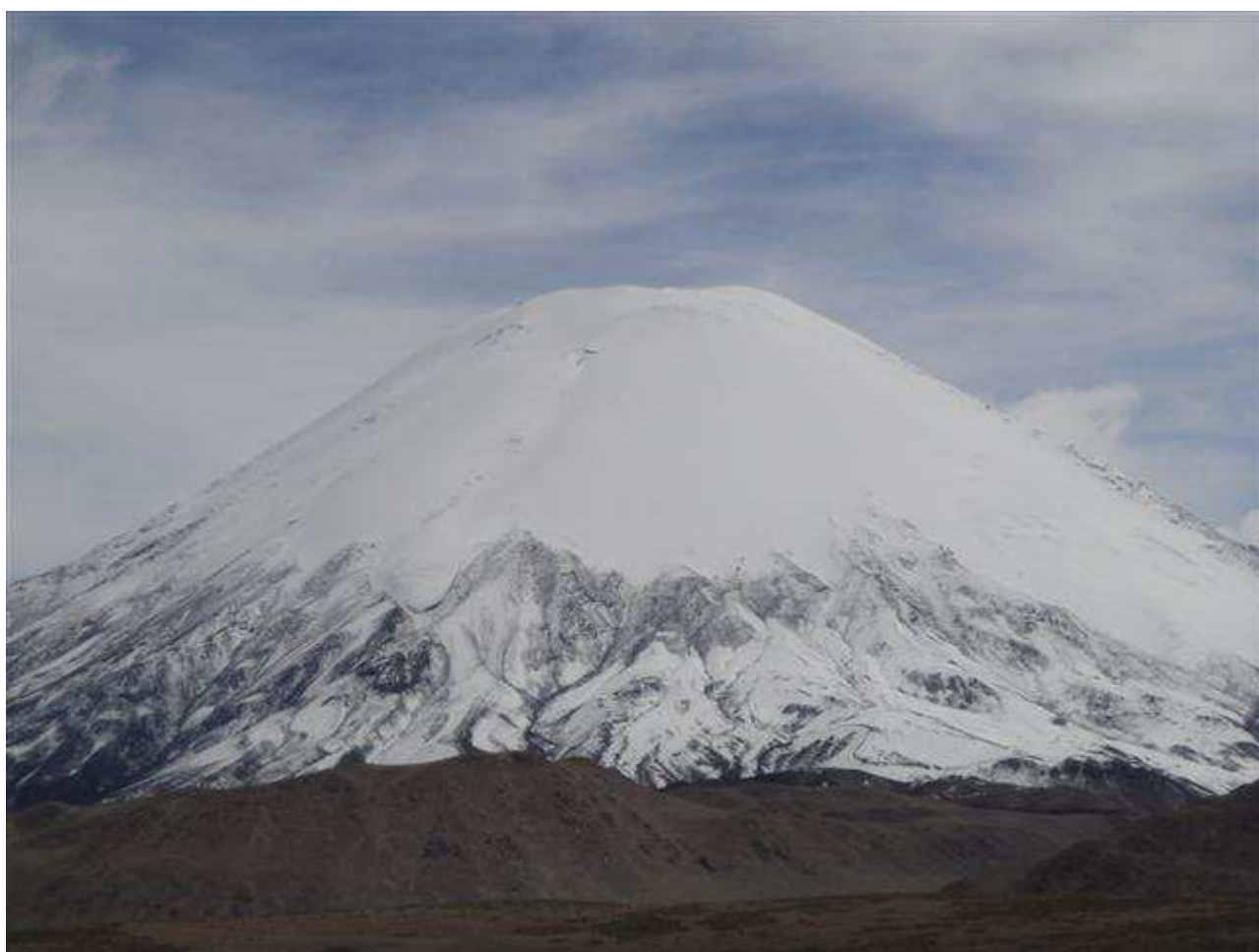
Anhang 9: ekeko.jpg (108KB) 0-9 a