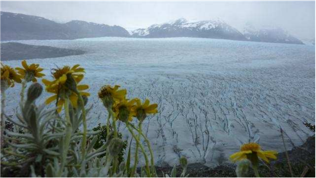
Anhang 5: cerro.jpg (29KB) 0-5 a