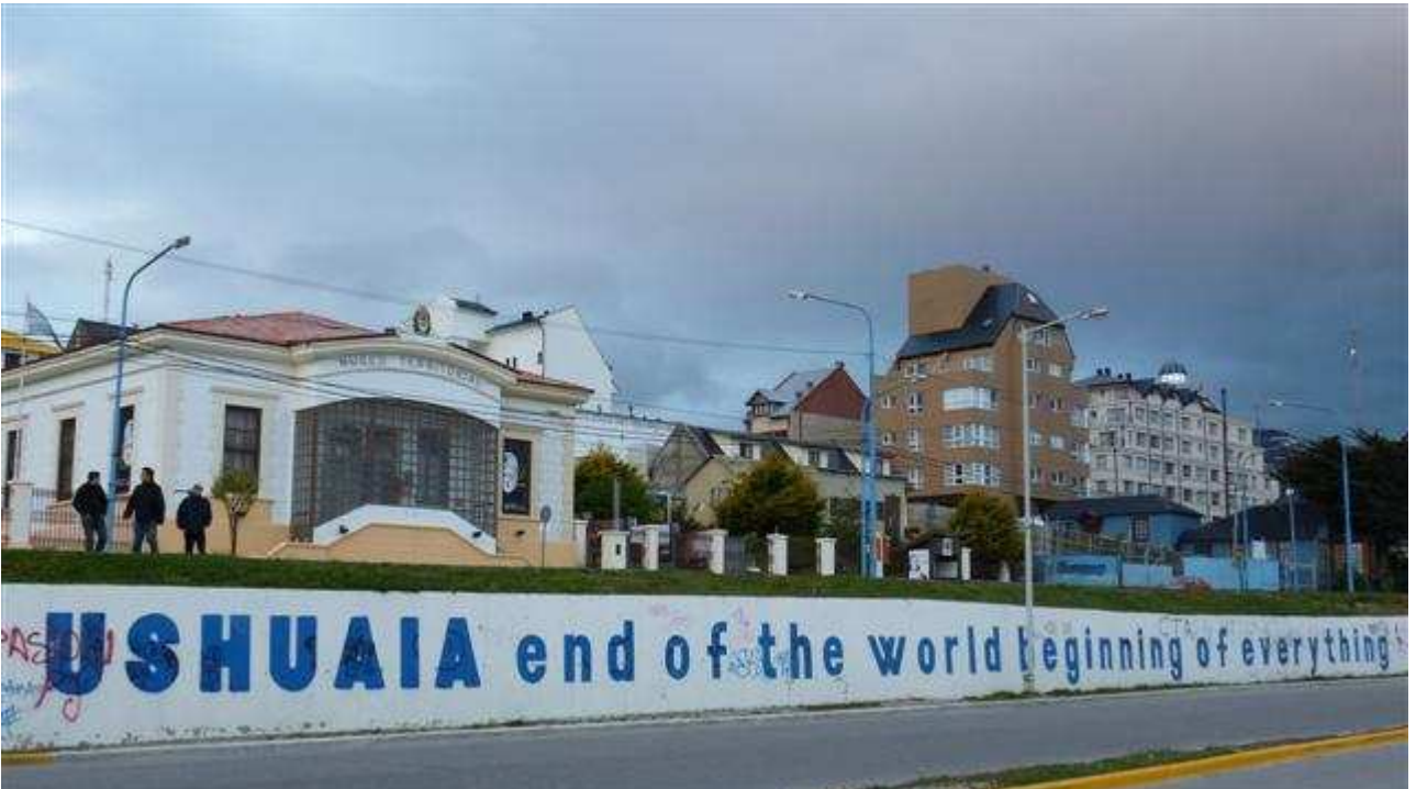
Anhang 3: 32.jpg (117KB) 0-3 a