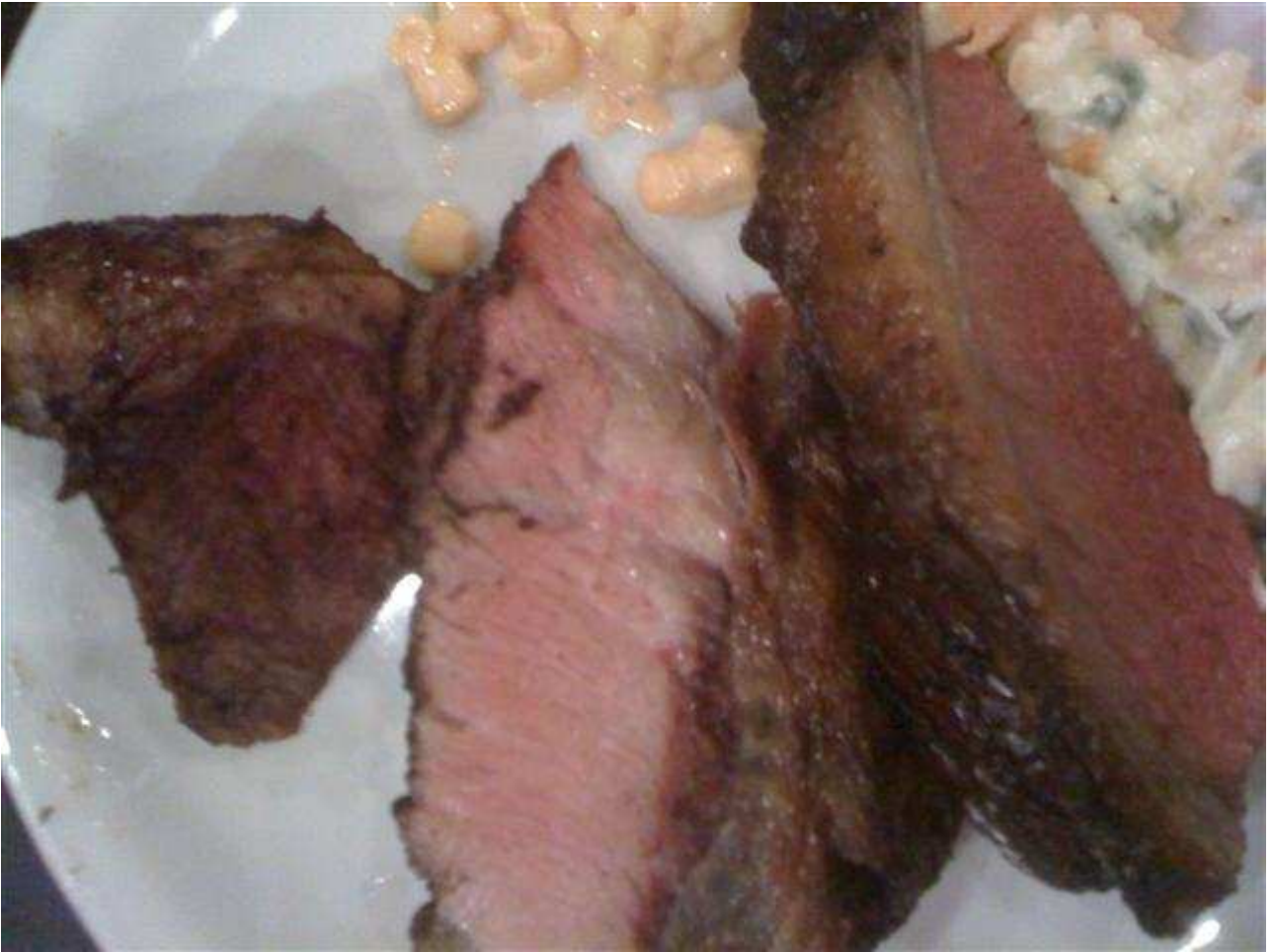
Anhang 2: ushuaia.jpg (54KB) 0-2 a