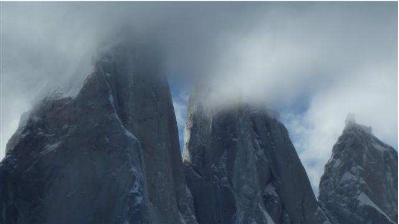
Anhang 6: smile.jpg (31KB) 0-6 a