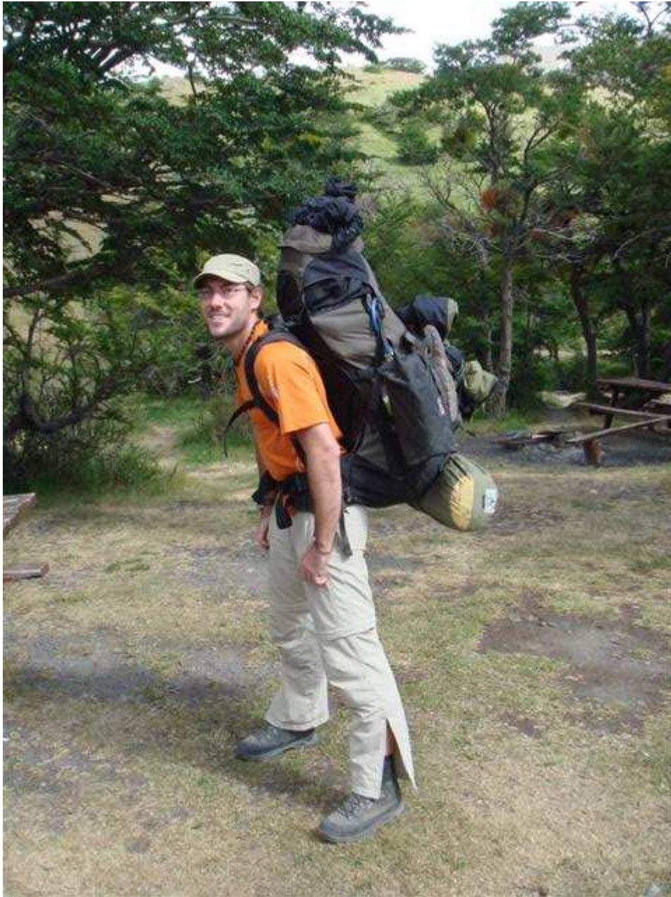
Anhang 4: grey.jpg (53KB) 0-4 a