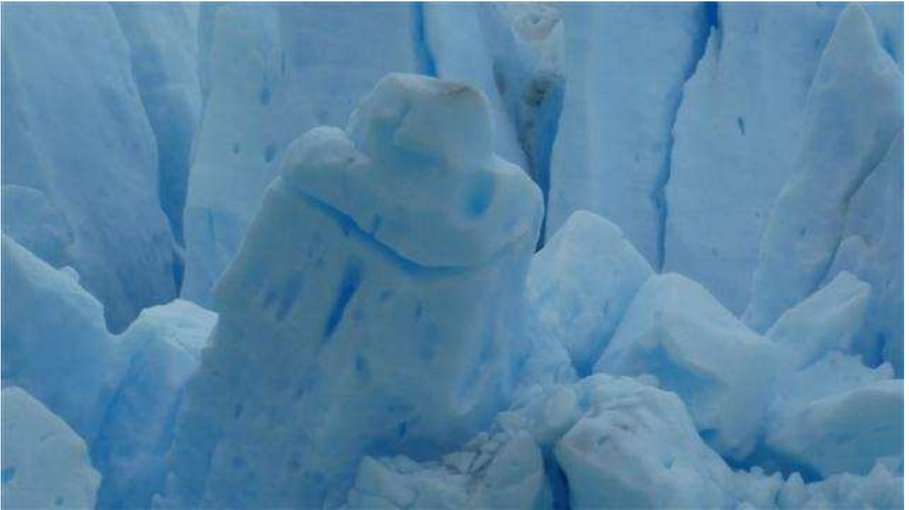
Anhang 7: weather.jpg (53KB) 0-7 a